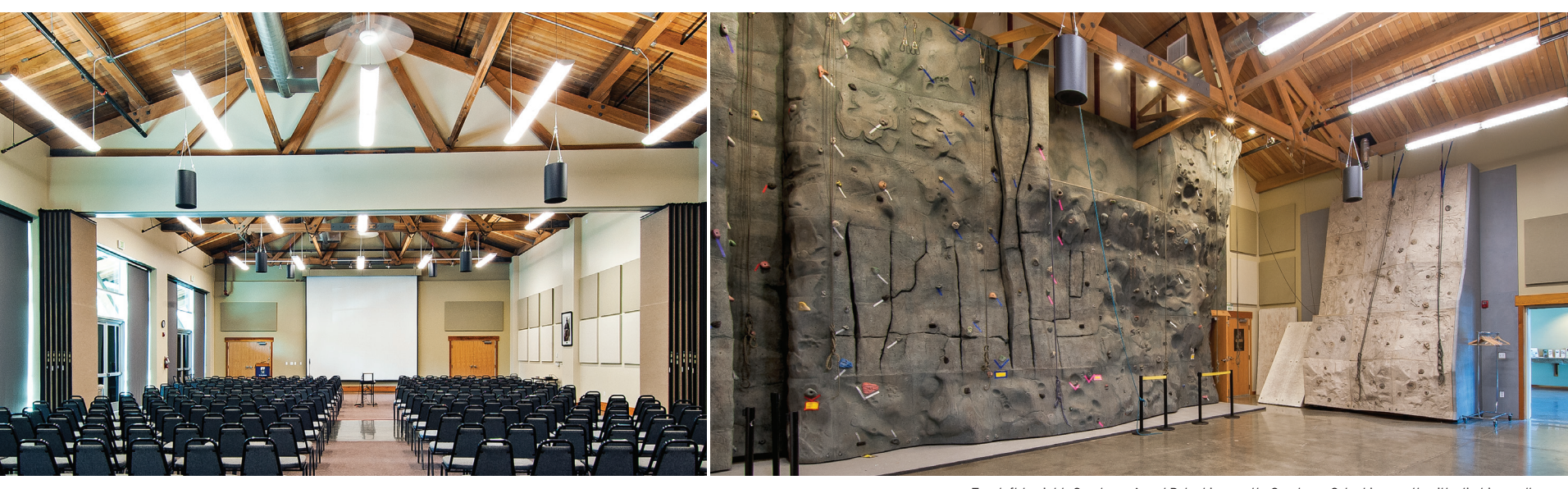
Top, left to right: Goodman A and B, looking north; Goodman C, looking south with climbing wall.

Weekday (M-F): $840 for 4 hrs/$125 each additional hour Weekend (Sat-Sun): $1,370 for 4 hrs/$210 each additional hour Seating Capacity: Theater: 220; Banquet: 150; Classroom: 115 AV: 1 screen on the east wall, with audio-visual setup available Ideal for: workshops, conferences, presentations